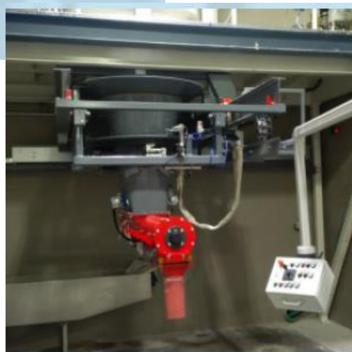
Filling of all types of molds (metallic, PU, silicone, etc.)

Dosing unit in weight and volumetric mode that can be controlled manually or automatically.